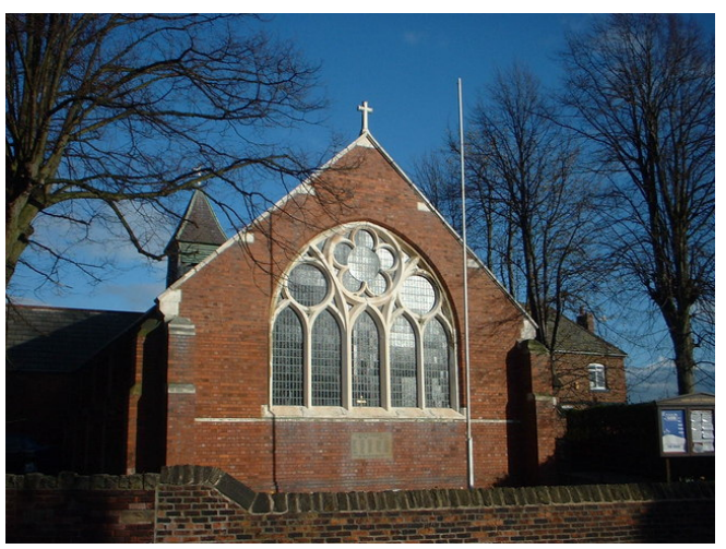
Our churches are still open for visits at the following times:

Monday 4pm-5pm St Mary Magdalene's Outwood Tuesday 10-11:30am St Peter's Stanley Wednesday 2-4pm St Anne's Wrenthorpe Saturday 10-12pm St Mary Magdalene's Outwood (on 19<sup>th</sup> December only) Saturday 10-12pm St Paul's Alverthorpe